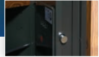
Large Bolt Work Protects Valuables