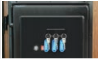
Inside Door Key Hanger