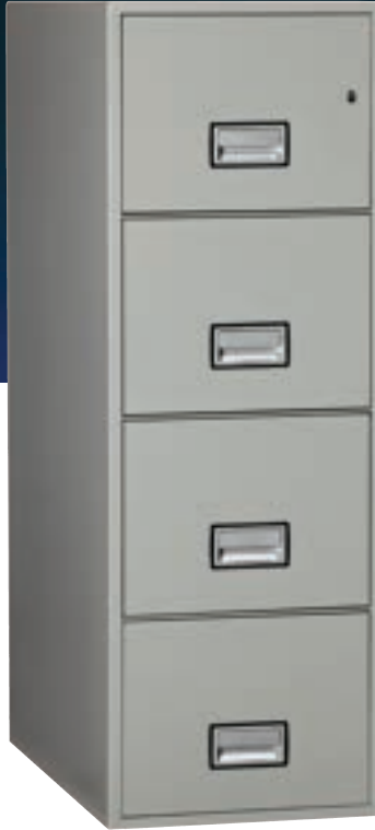
LGL4W25 Light Gray