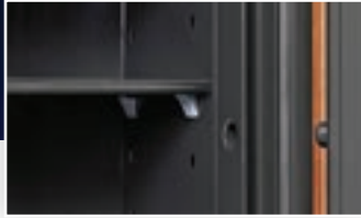
Height Adjustable Shelf (Additional Shelves Available)

FIRE, EXPLOSION & MTC GRADE B PROTECTION