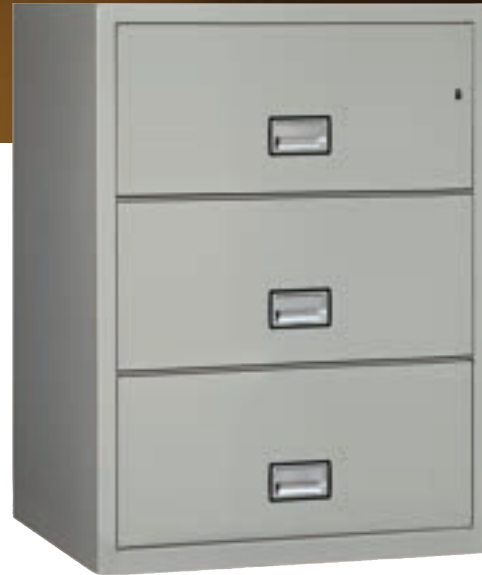
LAT3W31 Light Gray