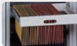
Pull-out File Hanger

Side Tab Filing Shelf available for 509 model