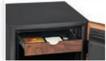
Small Walnut Slide Drawer (Additional Drawers Available)