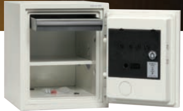
1222 - open